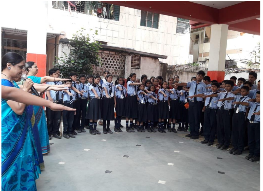
Staff and Students taking Oath