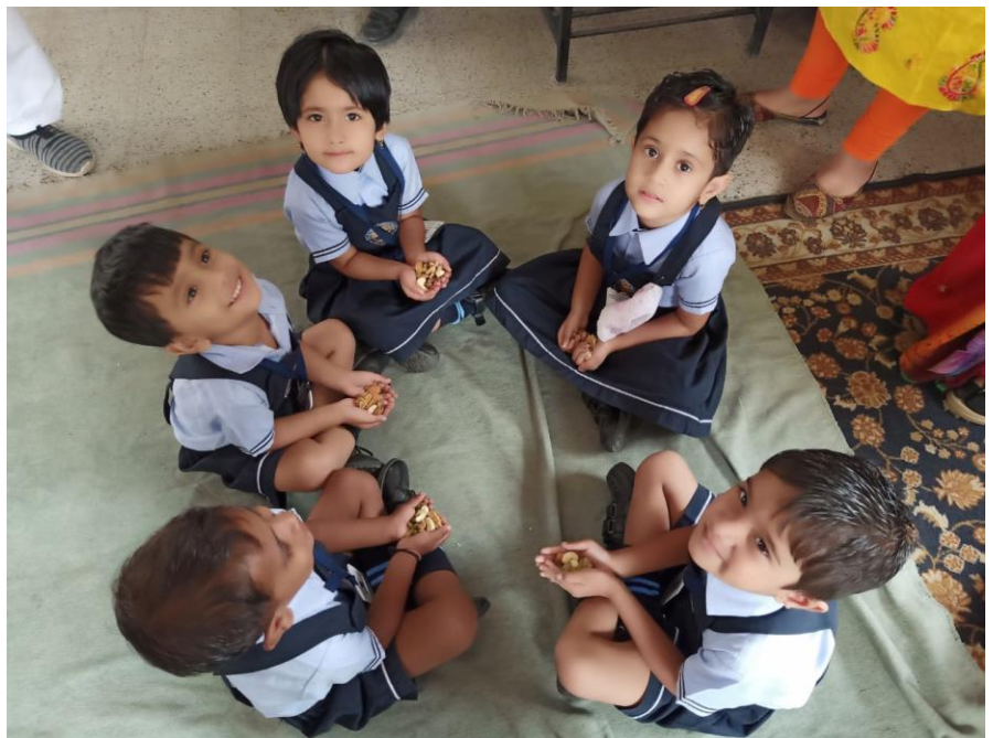
Our Students enjoying Dry Fruits

After many rabble – rousing speeches and incendiary lectures, some students thought defiance will not cause any harm. But they were wrong! Students were charged fine for breaking the rule of the school (of not talking in English). Initially some parents were furious and accused the school of overt money making. Later on, they were called and the underlying principles behind the pecuniary compensation were explained to them. We were delighted to receive their overwhelming support. They complimented our Director Madam